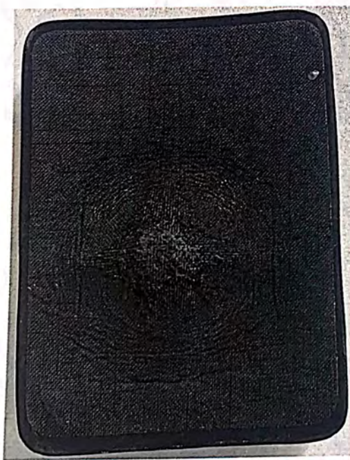
Fig. 2 Bulletproof Plate-ECO IV Sideplate 15×20 (wear face)